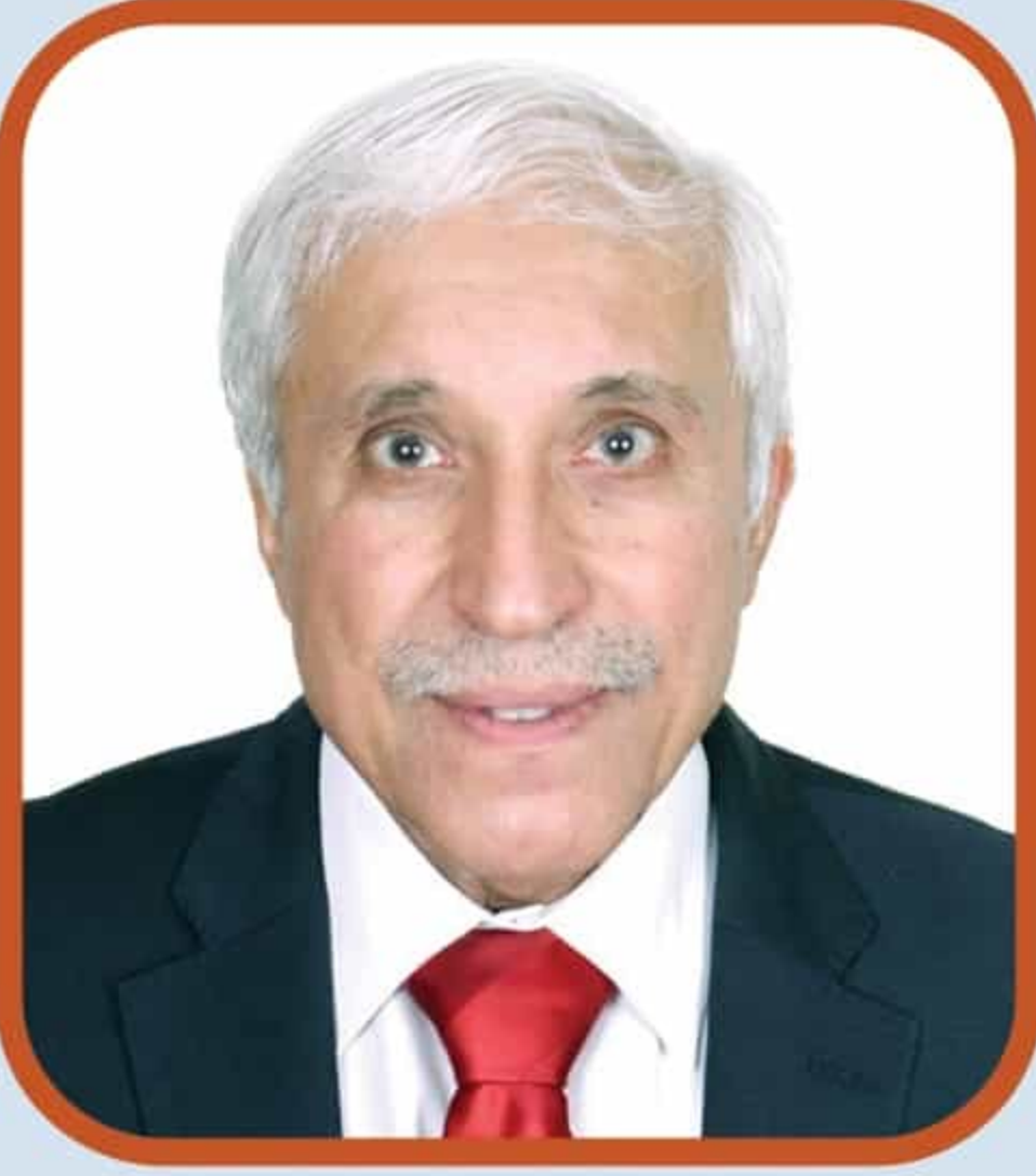
Mr. Qaiser Ahmed Shaikh Federal Minister Ministry of Maritime Affairs

The Blue Economy is regarded as the sustainable use of ocean or 'Blue' resources for socio-economic development, improving livelihoods and creating jobs while preserving the health of marine eco-system. Pakistan is strategically positioned in the Indian Ocean at the crossroads of major commercial trade routes. Given the